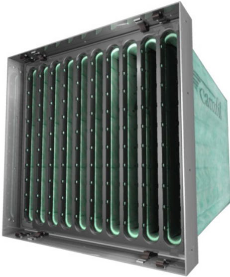
Hi-Flo® ES Filter not included.

Simplifies filter change by eliminating clips and fasteners, reducing filter replacement labor and time.